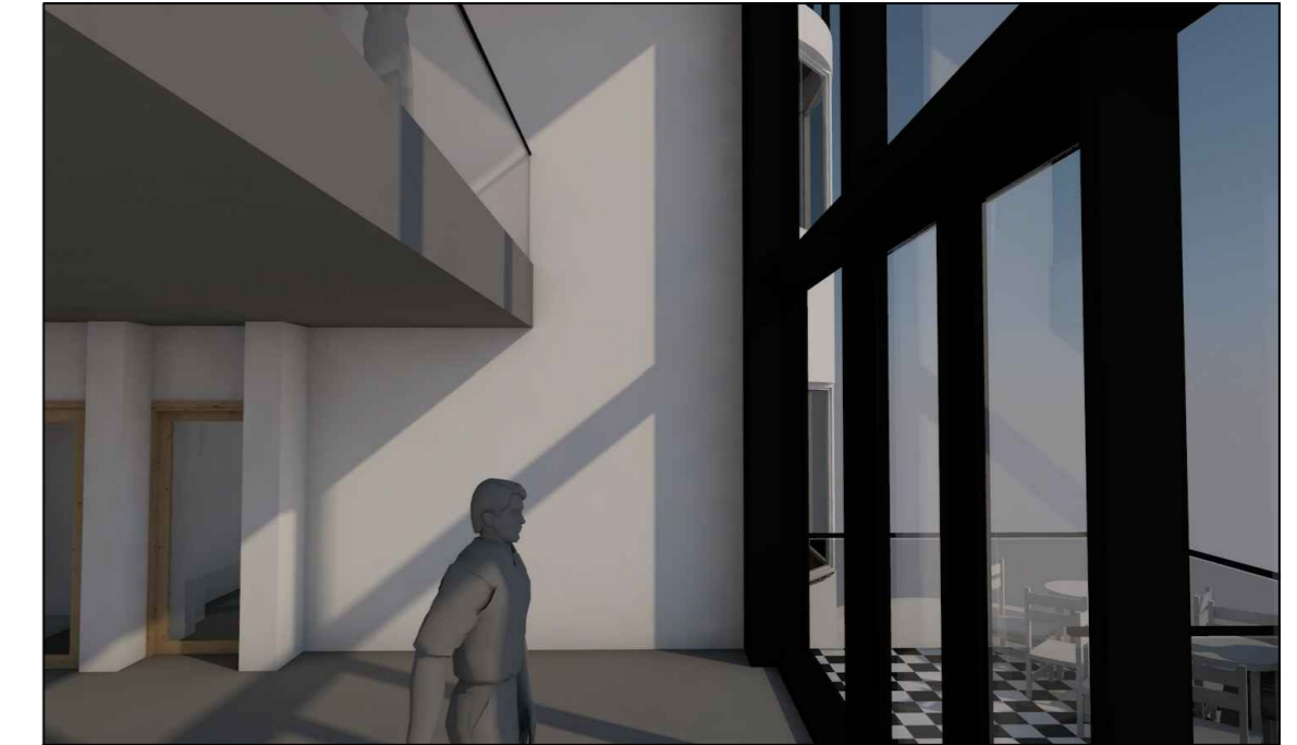
Proposed Internal View