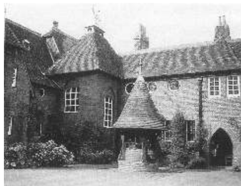
Red House: Philip Webb/William Morris c1860.