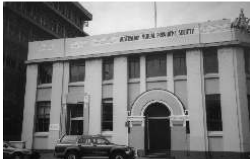
Old Amp. Louis Hay '34