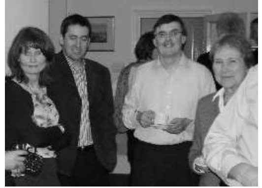
Volunteers' New Years meeting. County Club, Northampton

I am now both truly honoured and delighted to be given the opportunity to work with the 78 Derngate Trust and the Friends of 78 Derngate to continue the ongoing project to maintain and develop this site of national importance. I very much look forward to meeting the Friends and volunteers in due course.