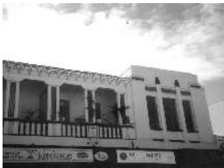
Spanish Mission style Colenso House '32.