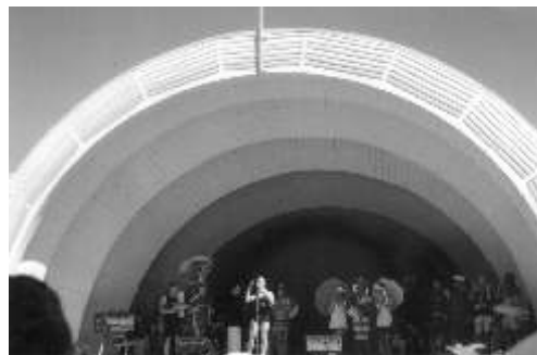
The Sound Shell: bathing belles.