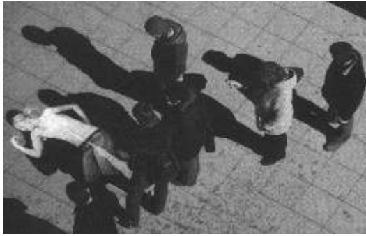
Underscan by Rafael Lozano-Hemmer

The Friends took part in the 50/50 café in Northampton Fish Market in early February during the internationally acclaimed Underscan light show presentation on Northampton's Market Square. Northampton Arts Collective ran the café over a period of ten days and we were able to have a display board and publicise 78 & the Friends.